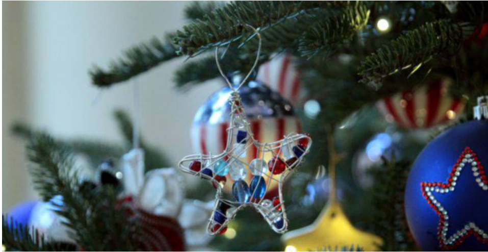
A beaded star ornament in the East Landing Room of the White House, December, 2012.

The trees in the East Landing Room are decorated with a variety of handmade beaded stars of red, white, and blue. You can make these yourself with supplies you can find at any craft store.