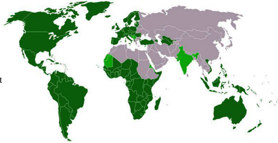
Green shows where the Latin Alphabet is used today.

The Vatican City has Latin as its official language, even though the language is extinct. Two thousand years ago, Latin was spoken throughout the Roman Empire, which extended at its height from Portugal to Iraq and from Britain to North Africa. During the Middle Ages and the early modern era, Latin was the predominant language of the Church and of Universities in western Europe. Many Latin words and phrases are still used in the fields of law, science and medicine.