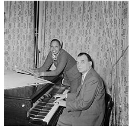
Baker in Amsterdam, 1954