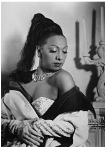
Baker in Havana, Cuba

An incident at the Stork Club interrupted and overturned her plans. Baker criticized the club's unwritten policy of discouraging black patrons, then scolded columnist Walter Winchell , an old ally, for not rising to her defense. Winchell responded swiftly with a series of harsh public rebukes, including accusations of Communist sympathies (a serious charge at the time). The ensuing publicity resulted in the termination of Baker's work visa, forcing her to cancel all her engagements and return to France. It was almost a decade before U.S. officials allowed her back into the country. [40]