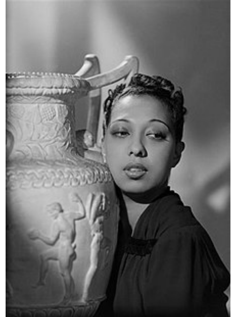
Baker in 1940.

In 1949, a reinvented Baker returned in triumph to the Folies Bergere. Bolstered by recognition of her wartime heroics, Baker the performer assumed a new gravitas, unafraid to take on serious music or subject matter. The engagement was a rousing success, and reestablished Baker as one of Paris' preeminent entertainers. In 1951 Baker was invited back to the United States for a nightclub engagement in Miami. After winning a public battle over desegregating the club's audience, Baker followed up her