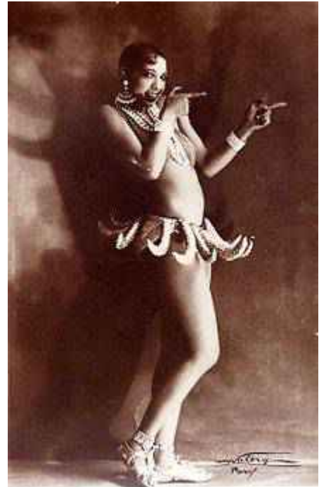
Baker in her banana costume