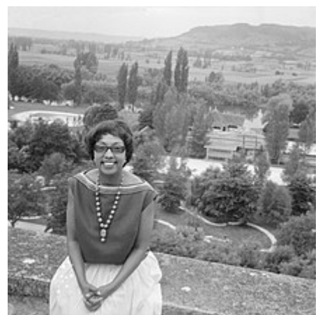
Baker at the Château des Milandes, 1961