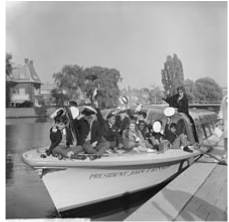
Baker with ten of her adopted children, 1964

Four days later, Baker was found lying peacefully in her bed surrounded by newspapers with glowing reviews of her performance. She was in a coma after suffering a cerebral hemorrhage . She was taken to Pitié-Salpêtrière Hospital , where she died, aged 68, on 12 April 1975. [60][61]