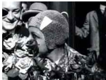
Play media Arrival of Baker in The Hague in 1928