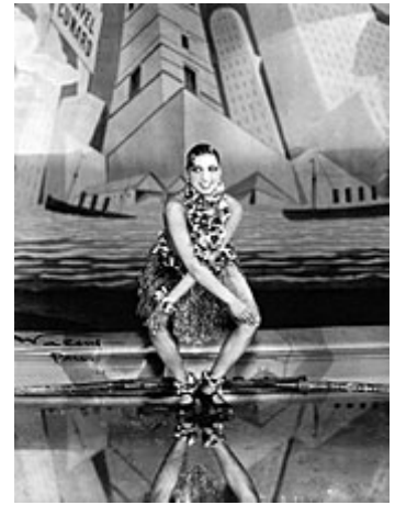
Baker dancing the Charleston, 1926