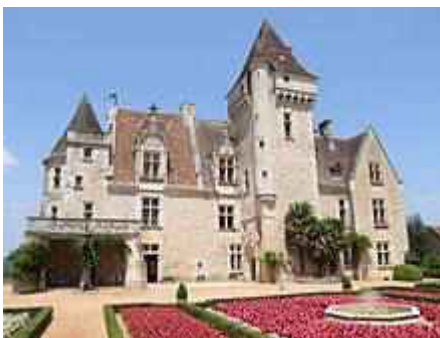
Château des Milandes which she rented from 1940 before purchasing in 1947.

Château des Milandes , a castle near Sarlat in the Dordogne , was Baker's home where she raised her twelve children. It is open to the public and displays her stage outfits including her banana skirt (of which there are apparently several). It also displays many family photographs and documents as well as her Legion of Honour medal. Most rooms are open for the public to walk through including bedrooms with the cots where her children slept, a huge kitchen, and a dining room where she often entertained large groups. The bathrooms were designed in art deco style but most rooms retained the French chateau style.