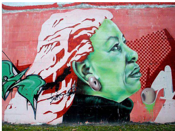
Street art depicting Toni Morrison in Vitoria, Spain.

In writing about the 1998 impeachment of Bill Clinton, Morrison wrote that, since Whitewater , Bill Clinton had been mistreated because of his "Blackness":