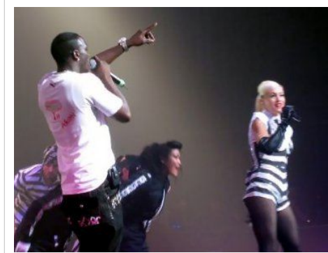
Akon performing with Gwen Stefani on The Sweet Escape Tour.