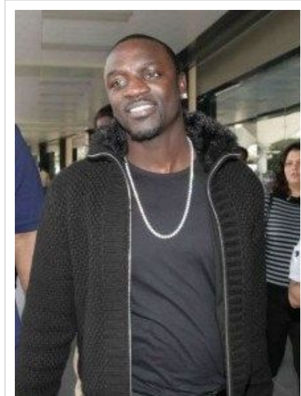
Akon at a Mumbai airport.

The album's first single, "Angel", was released to US radio stations on September 14, 2010, [15] and was released as a single on September 27, 2010. It was produced by French producer David Guetta. Akon performed the song during the 2010 Victoria's Secret Fashion Show. Akon travelled to Jamaica to work with Damian, Julian & Stephen Marley. The promotional single "Dirty Work" (feat. Wiz Khalifa) was released in February 2013 free of charge. The lead single from Stadium "So Blue" was released November 11th 2013 [16]