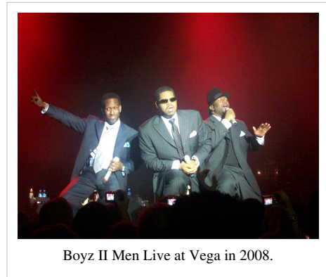
Boyz II Men Live at Vega in 2008.

In 2008, Boyz II Men's three members appeared on Celebrity 'Don't Forget the Lyrics' and created a sensation with their performance. They earned $500,000 for their two nominated charities; the appearance also generated interest in their next release.