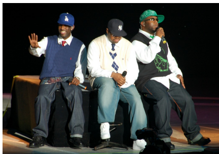
Boyz II Men at the Genting Highlands, Malaysia in 2007.