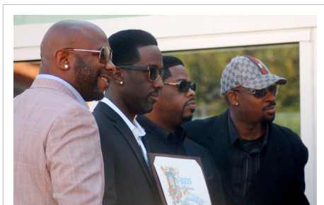
Boyz II Men receiving a star on the Hollywood Walk of Fame in January 2012

Originally, Boyz II Men announced a reunion with original member Michael McCary for the Twenty album. On September 6, 2009, at a concert in Virginia Beach, Virginia, Stockman announced that their upcoming 20th anniversary album "include all 4 members," sparking a tremendous applause. But soon after that announcement, McCary declined and did not join the project.