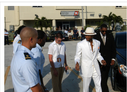
Usher arriving in Miami, Florida to attend the 2004 MTV Video Music Awards

Usher's fourth studio album, Confessions , was released on March 23, 2004—just as its first single, "Yeah!", was in its sixth week at number one on the Billboard Hot 100 and fifth week on top of the Hot R&B/Hip-Hop Singles Chart. The album's nearly 1.1 million unit debut sales was the highest first-week numbers ever scanned by a male R&B artist and the seventh best of the Nielsen SoundScan history. To date, the album has accumulated sales of over 20 million copies worldwide, over 10 million of which were sold in the United States, earning the album a Diamond certification by the Recording Industry Association of America.