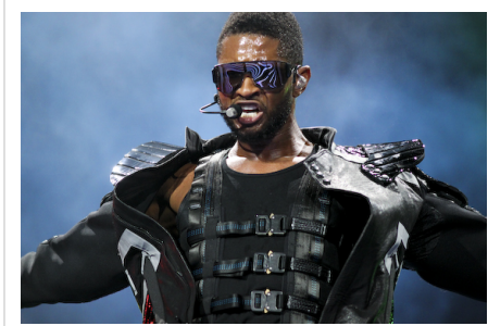
Usher on the OMG Tour