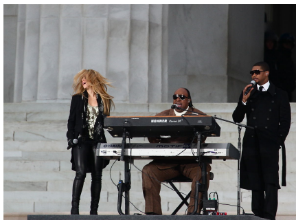
Usher performing with Stevie Wonder and Shakira at the We Are One: The Obama Inaugural Celebration at the Lincoln Memorial

In spring of 2005, Usher scored a number three Hot 100 hit as a featured vocalist on Lil' Jon's "Lovers & Friends". In 2007, Usher also collaborated with R. Kelly on the track "Same Girl", for Kelly's album, Double Up . He was also featured in a remix version of Omarion's "Ice Box". Usher also appeared on the track "Shake Down" on American singer-songwriter Mary J. Blige's 2007 album Growing Pains . In November 2005, Usher starred as a disc jockey named Darrell in the Lions Gate film, In the Mix . On August 22, 2006, Usher took over the role of Billy Flynn in the long-running Broadway musical Chicago .