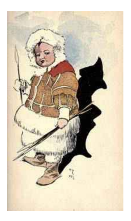
L for Laplander.

I think the Laplander is nice, He lives among the snow and ice; The reindeer drags his sledge for him, And gives him meat and milk to skim.