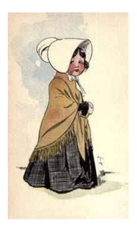
Q for Quakeress.

I like the little Quakeress, She is so quaint; I like her dress, Her very, very plain white bonnet, Her stuff gown with no trimming on it.