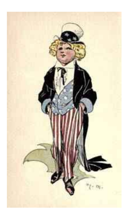
U for United States.

The States are full of mush and pie And houses twenty stories high, Saw-mills and millionaires and bustle; The people there "have got to hustle."