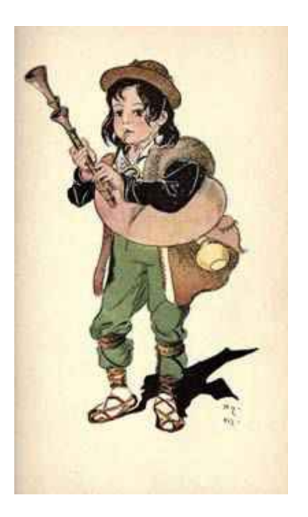
N for Neapolitan.

The Neapolitan is wise, He plays the pipes for pence, and buys Ice-cream and candy every day To help him on his weary way.