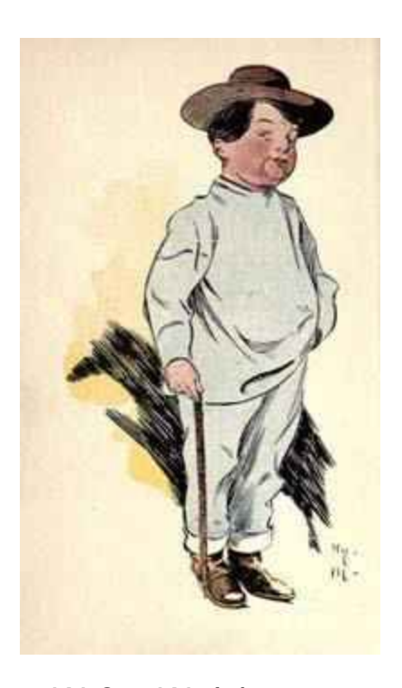
W for Welshman.

Taffy, my boy, I've heard with grief That shocking tale about the beef; But Taffy, between me and you, I really don't believe it's true.