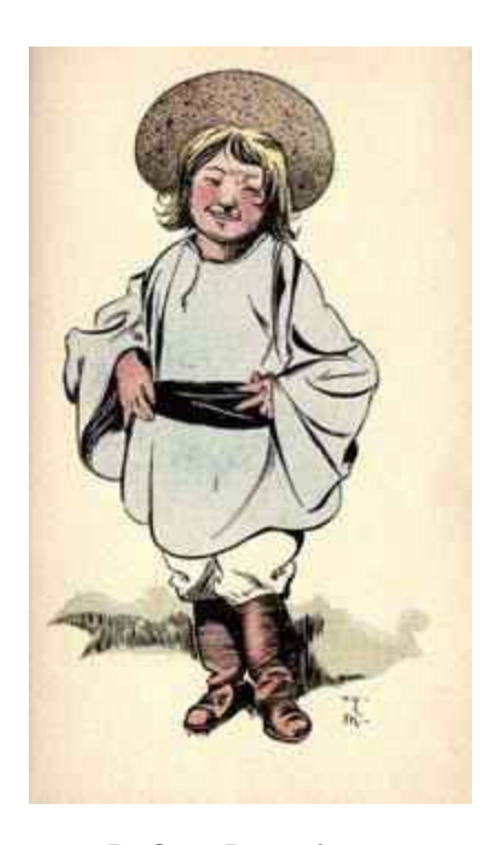
R for Russian.

Russia is noted for its tar, Its leather, and its great, white Czar. A Russian wears his clothes quite loose, And drinks his tea with lemon juice.