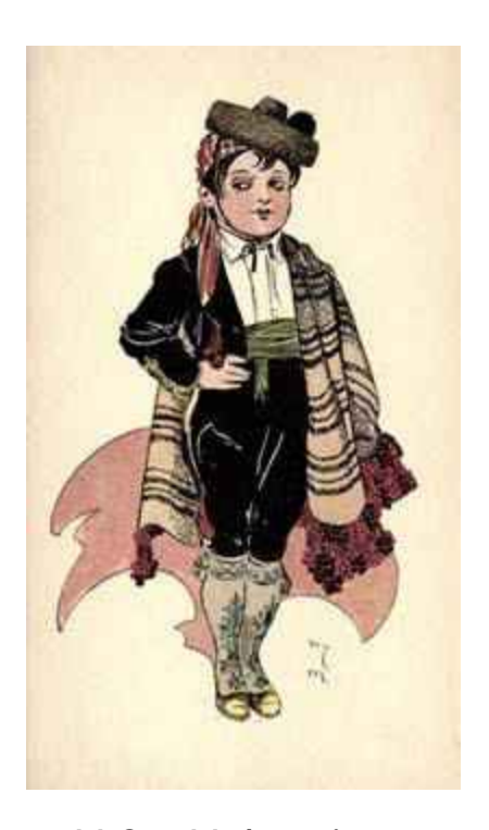
V for Valencian.

Valencia's a little town In Spain. It's dusty and baked brown, And full of dirt and mules and fleas, And all around are orange trees.