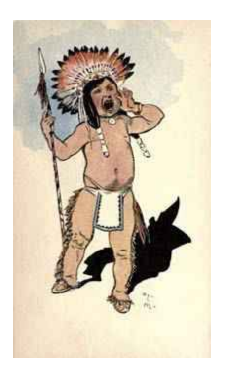
I for Indian.

The Indian boy is neatly dressed; He has no shirt, he wears a crest Of eagle's feathers on his head, His skin is of a coppery red.