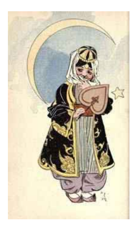
O for Odalisque.

O pretty little Odalisque, I know you want to dance and frisk And play at hide and seek with me; And yet, you know, it cannot be,