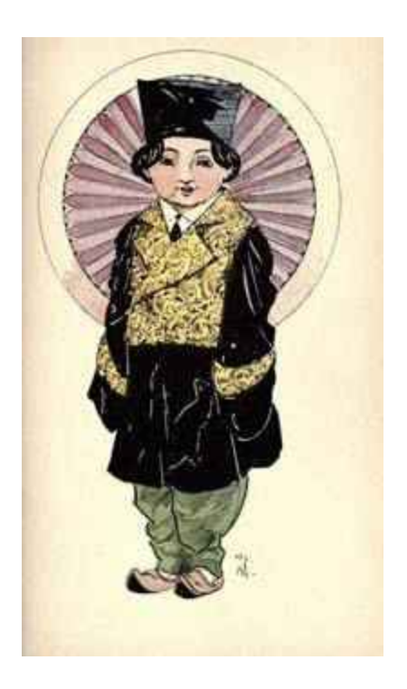
P for Persian.

The Persian has a funny hat, He often sits upon a mat; He hears the bulbul sing, and roves Through rose-gardens and lemon groves.