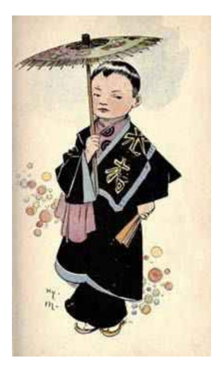
J for Japanese.

The little Japs are rather small, Even their fathers are not tall; They're very fond of parasols, They dress themselves just like their dolls.