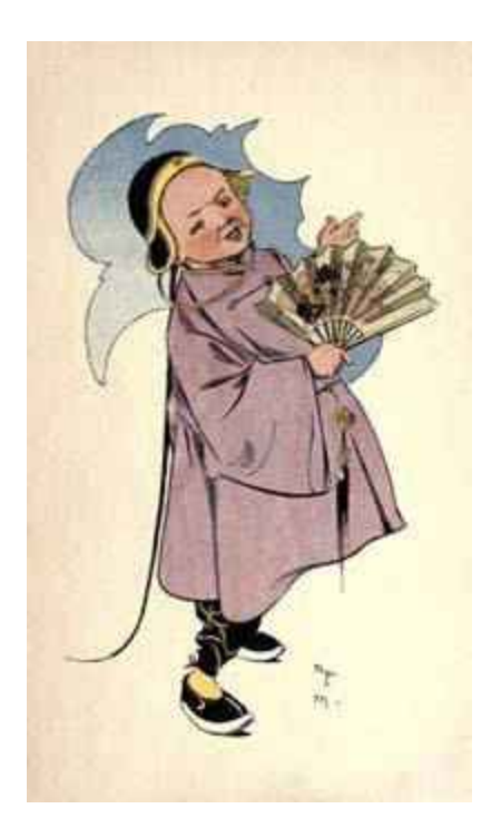
C for Chinaboy.

Li has a pigtail and a fan, And yet he's not a Chinaman; In fact, he is his mother's joy, A merry little Chinaboy.