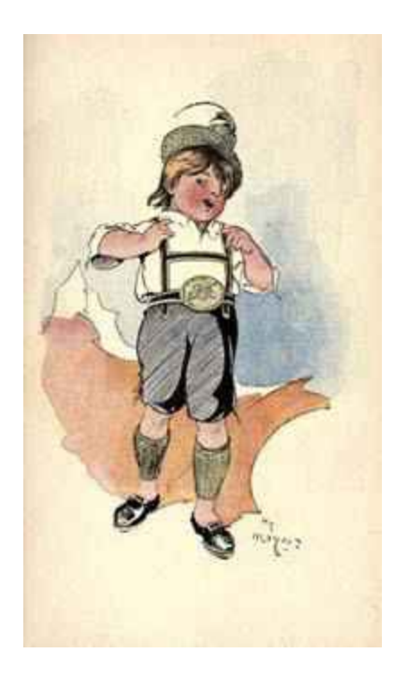
T for Tyrolean.

The Tyrol has a splendid air And mountains, mountains everywhere; The mountains are all tops and sides, You climb them best with ropes and guides.