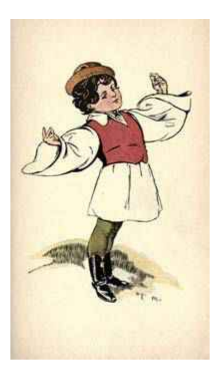
H for Hungarian.

In Hungary they hunt and fish; Between ourselves, I often wish I lived there, for it must be grand;— I've heard the Blue Hungarian Band.