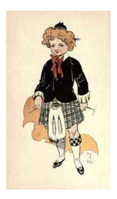
S for Scotch.

The Scotch wear kilts—both boys and men, When they don't know, they "dinna ken." They love the thistle, we the rose, They're fond of oatmeal, kail, and brose.