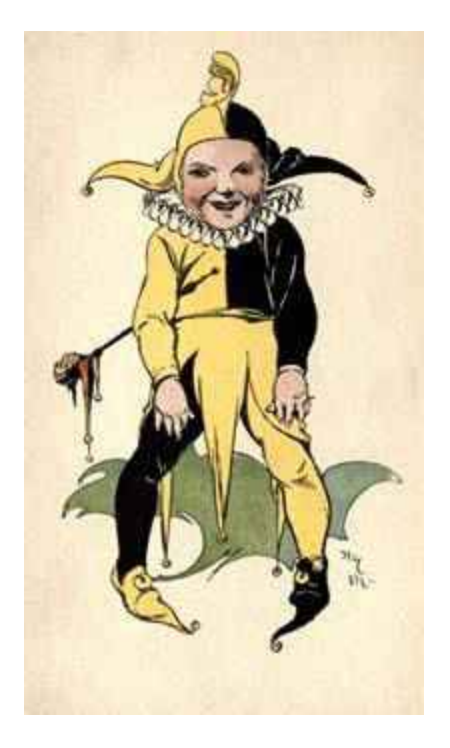
Z for Zany.

A zany is a kind of clown Who wanders idly up and down, And wags his head, and shakes his bells, And chortles at the tales he tells.