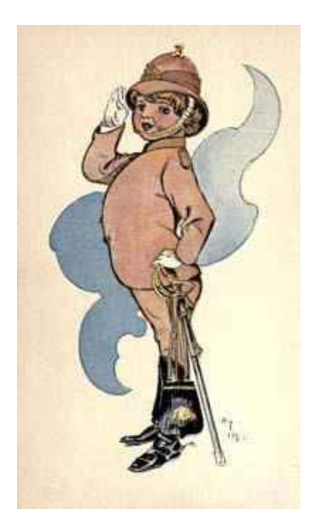
E for English.

The English are a splendid race, Sturdy of limb, honest of face; They own (this is geography) Much of the land and all the sea.