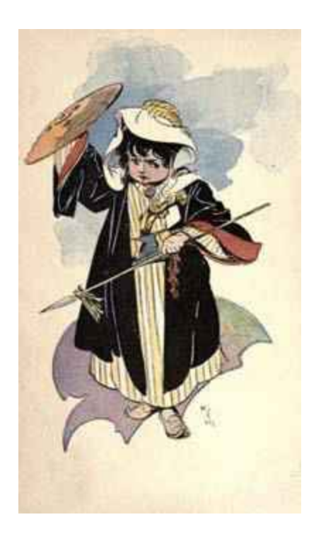
A for Arab.

This Arab is upset, I fear; Look at his pretty shield and spear. He's stuck two pistols in his sash, And, dear me, how his eyes do flash!