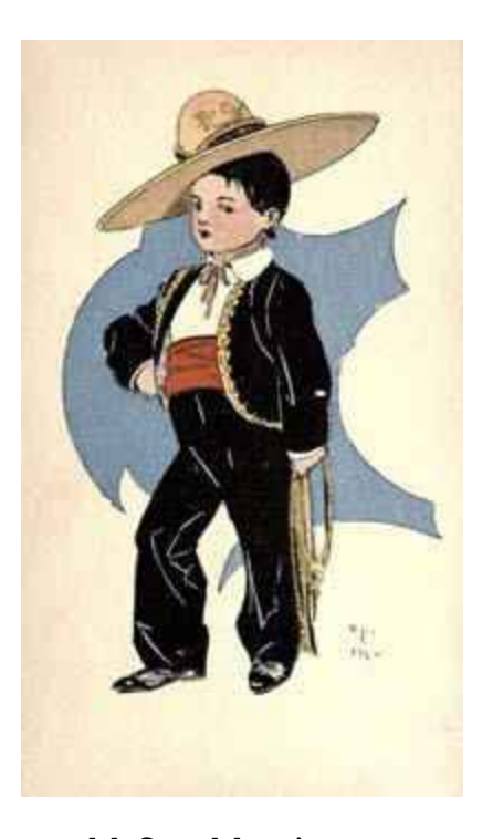
M for Mexican.

The plucky little Mexican Rides on the pampas like a man; His horse may kick, and plunge, and rear, He does not feel the least bit queer.