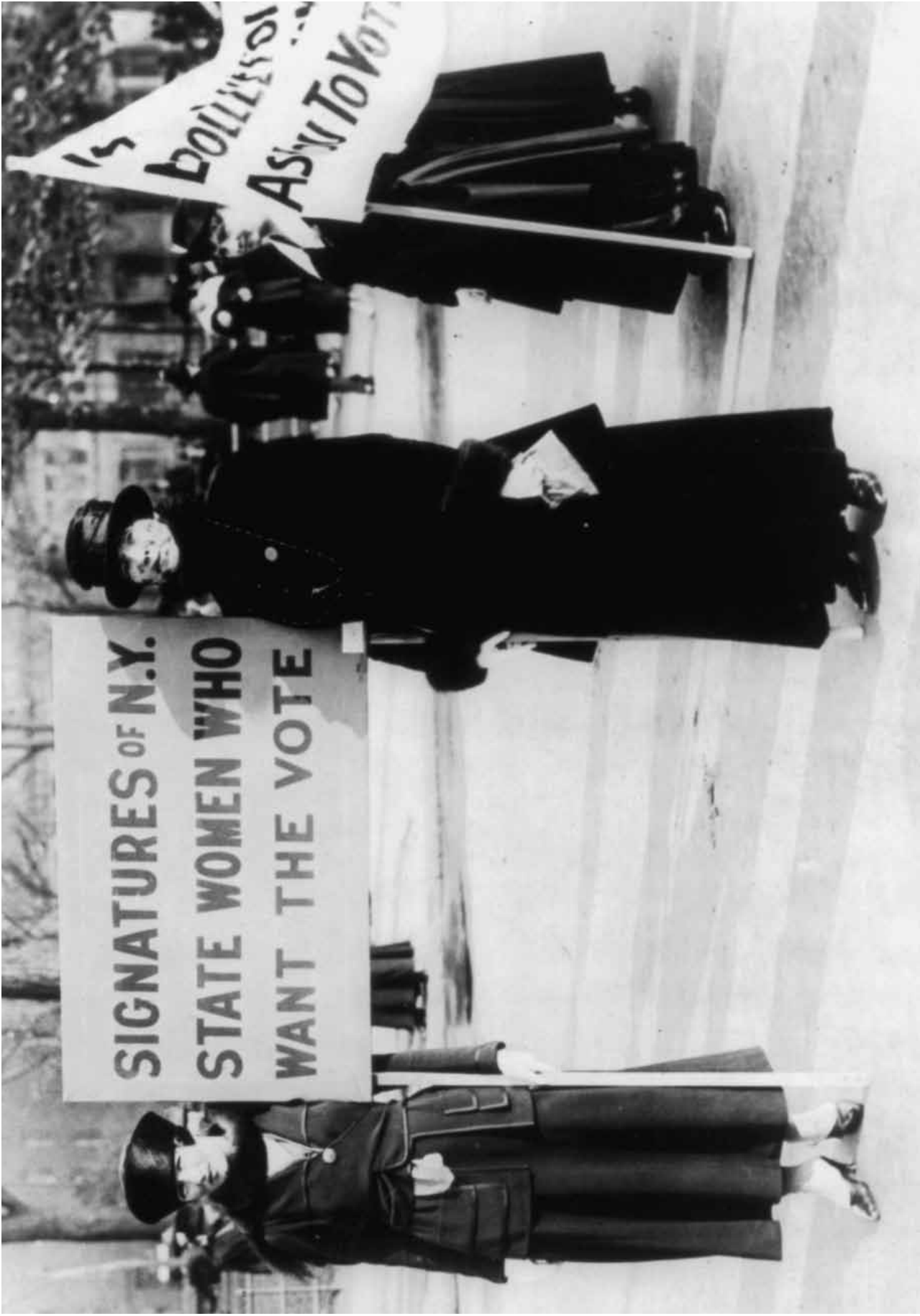
Until 1920, women were not allowed to vote in political elections. This image shows women petitioning for the right to vote (ca. 1917) in New York State.