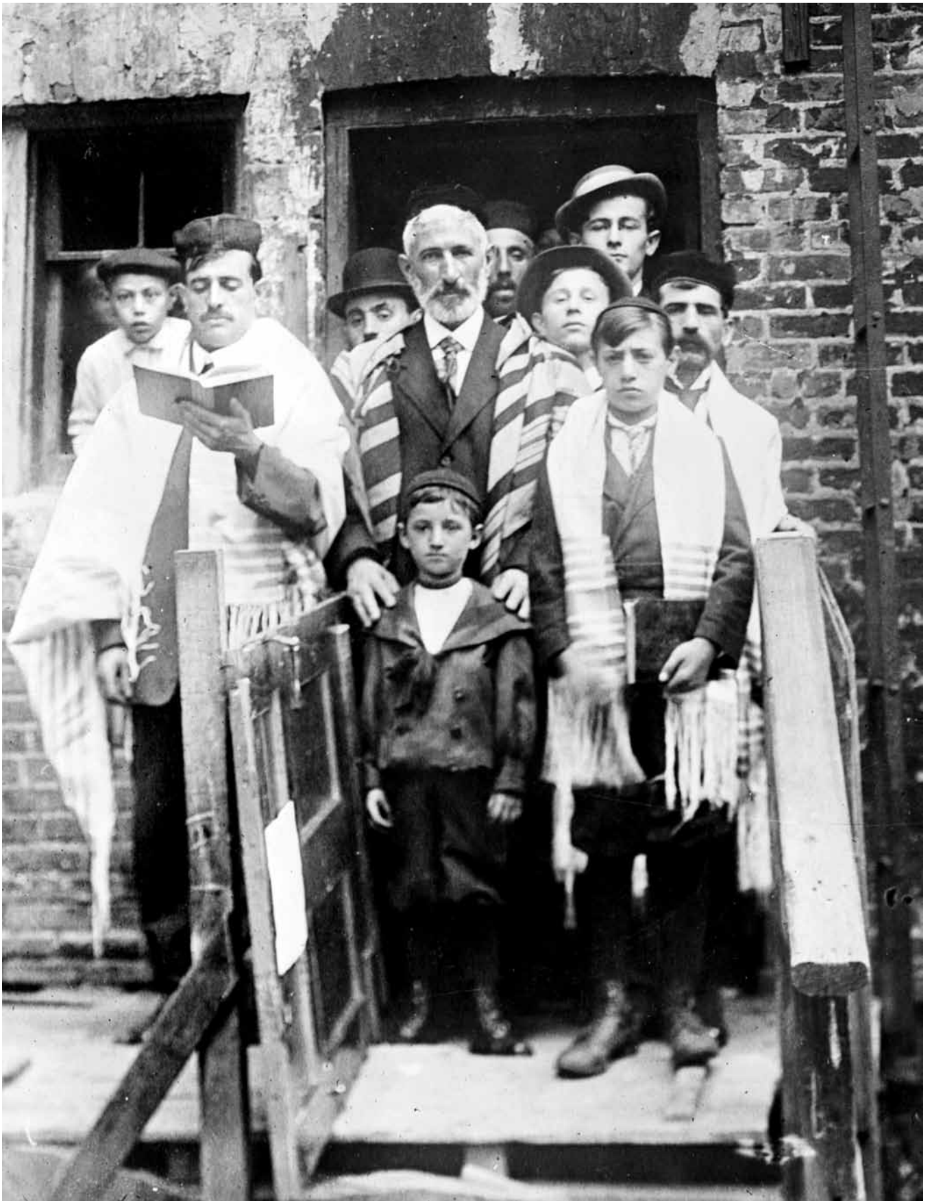
A synagogue on Yom Kippur, circa 1900. Courtesy of the Library of Congress, LC-DIG-ggbain-02316.