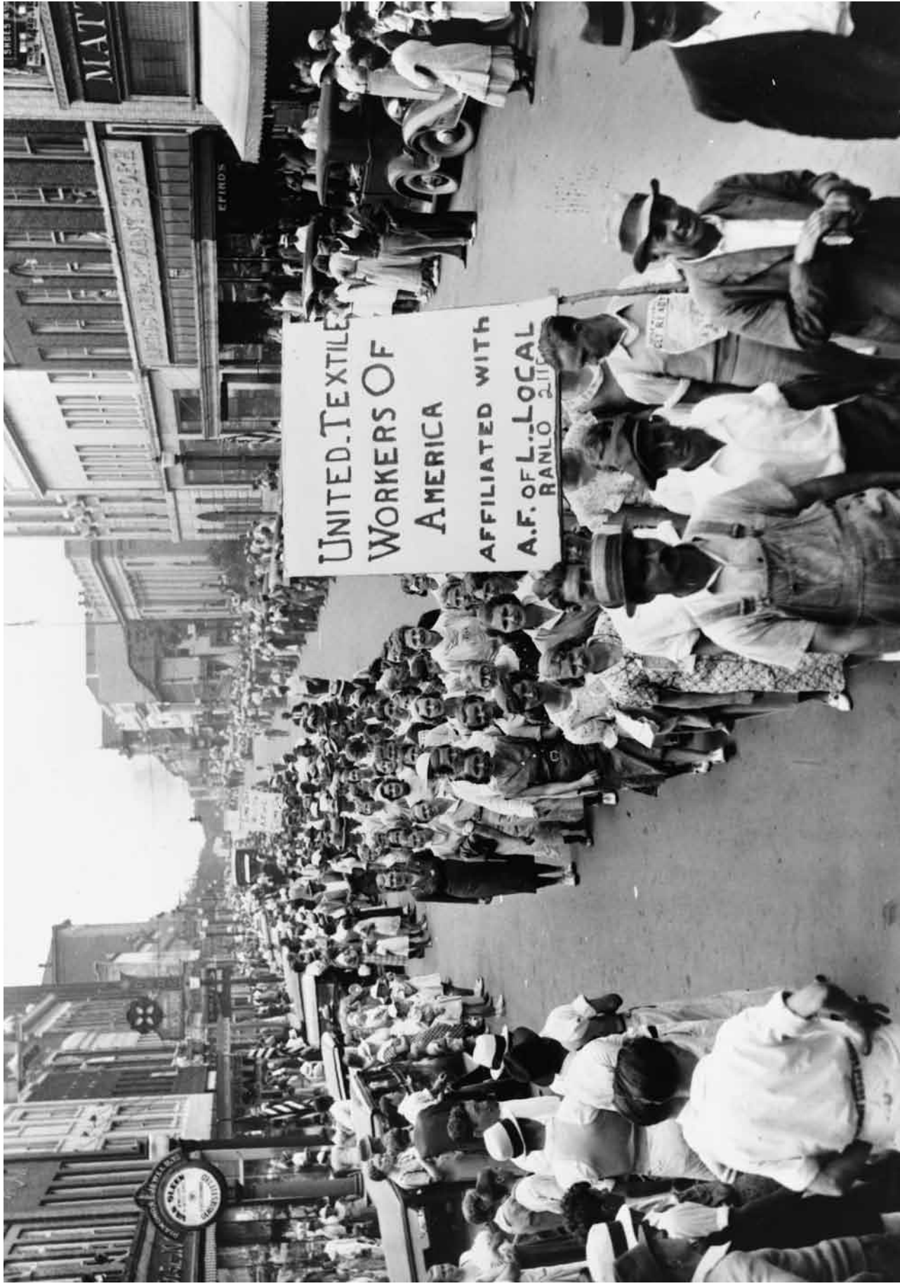
Striking textile workers participate in a Labor Day parade in Gastonia, North Carolina, 1934.