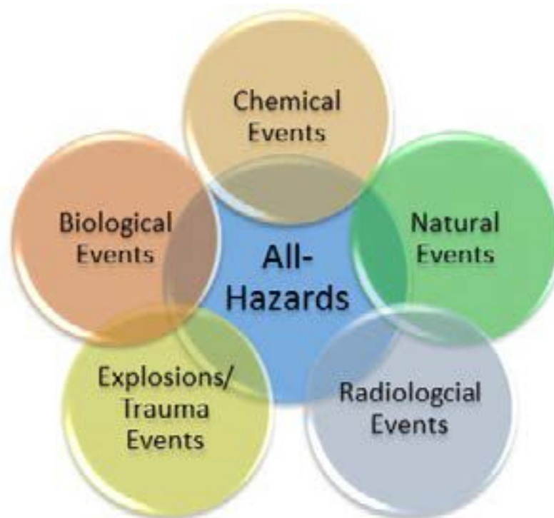
Figure 1: All-hazards approach maximizes available resources.

Peoples' Health Protected—Public Health Secured