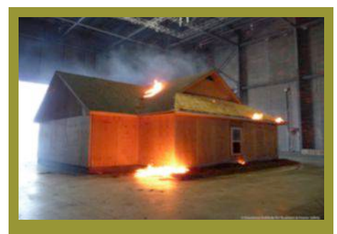
Photo 2. In order to be effective, external sprinklers must be able to wet all areas where ignition can occur, or be sufficiently effective in quenching embers that approach the home so they won't have enough energy to ignite combustible items.