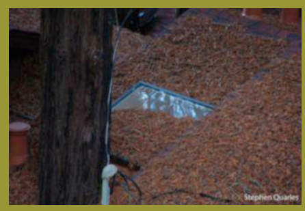
Photo 1. Accumulation of vegetative debris on top of a glass-type skylight on a low-slope roof.

Similar to windows, skylights that can open should be closed when a wildfire threatens. They also should incorporate a screen to resist the intrusion of embers in case the skylight happens to be left open (Photo 5) .