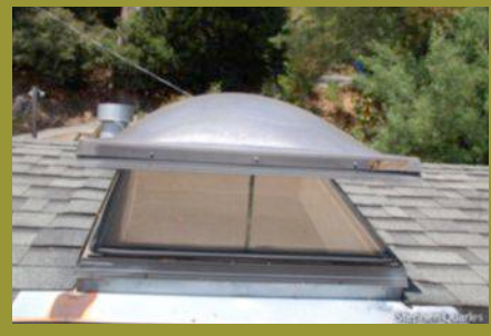
Photo 5. Operable skylights should be closed when a wildfire threatens. Similar to windows, they should incorporate a screen to resist the intrusion of embers (also good for insects!).