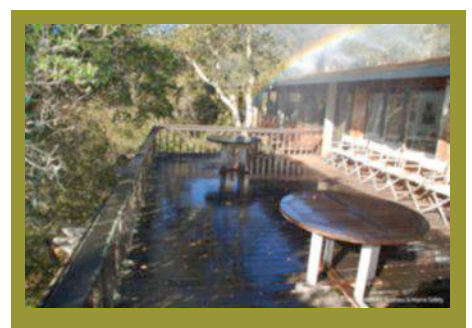
Photo 3. Roof-edge mounted sprinkler. Note these sprinklers did not deliver water in the near-home area. With this scenario, a sufficient number of wind-blown embers would have to be quenched in order to avoid ignition of the siding and decking in this zone, particularly at the deck-to-wall intersection.

This publication was produced in cooperation with the USDA Forest Service, US Department of the Interior and the National Association of State Foresters. NFPA is an equal opportunity provider. Firewise® and Firewise USA® are registered trademarks of the National Fire Protection Association, Quincy, MA. Firewise USA® is a program of the National Fire Protection Association.