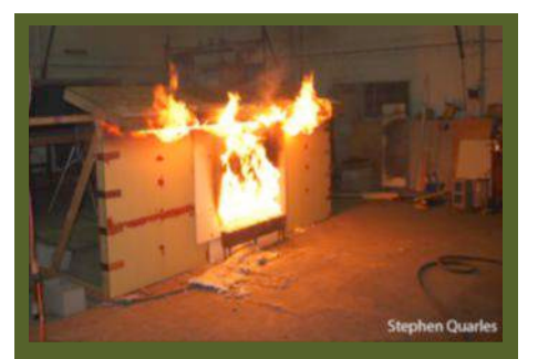
Flame impingement exposure to the underside of the eave, and time-toignition of the joists, blocking and fascia was quicker; and lateral flame spread faster, when an open-eave design was used in research experiments.