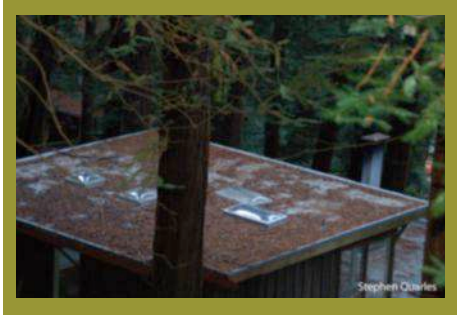
Photo 2. Minimal accumulation of vegetative debris accumulated on these dome-type skylights on this low-slope roof.