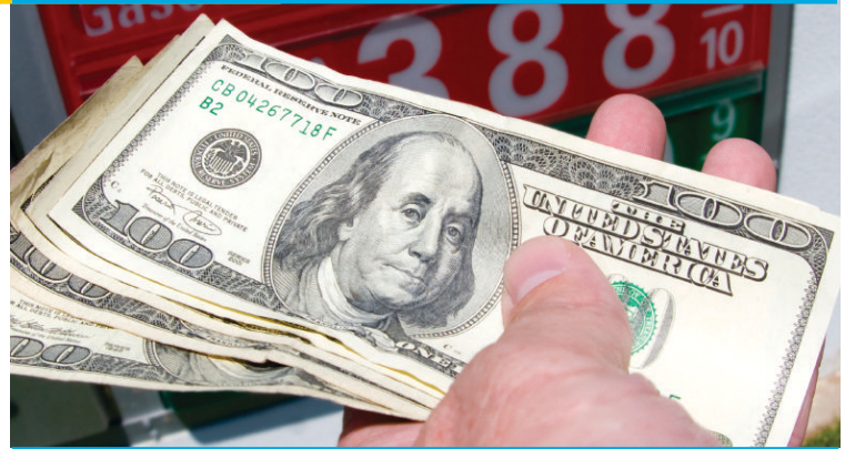
Our gas-saving tips can help you use less fuel and save money.