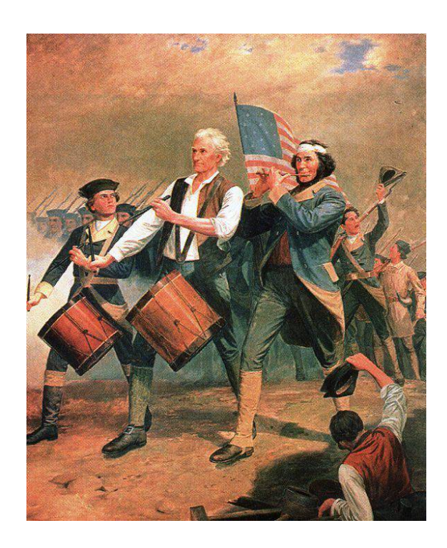
Originally entitled Yankee Doodle, this is one of several versions of a scene painted by A. M. Willard that came to be known as The Spirit of '76. Often imitated or parodied, it is a familiar symbol of American patriotism

designated "America's Official Fourth of July City-Small Town USA" by resolution of Congress. Seward has also been proclaimed "Nebraska's Official Fourth of July City" by Governor James Exon in proclamation. Seward is a town of 6,000 but swells to 40,000+ during the July 4 celebrations. [23]