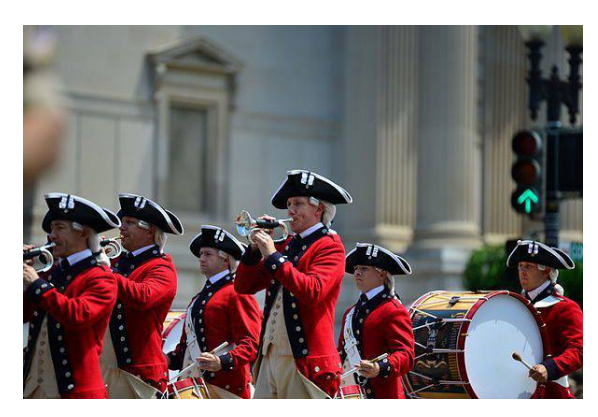
Independence Day Parade in Washington, D.C.

Independence Day fireworks are often accompanied by patriotic songs such as the national anthem "The Star-Spangled Banner", "God Bless America", "America the Beautiful", "My Country, 'Tis of Thee", "This Land Is Your Land", "Stars and Stripes Forever", and, regionally, "Yankee Doodle" in northeastern states and "Dixie" in southern states. Some of the lyrics recall images of the Revolutionary War or the War of 1812.