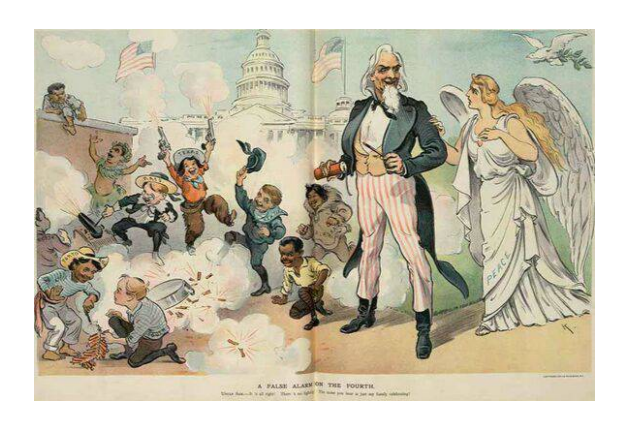
American children of many ethnic backgrounds celebrate noisily in 1902 Puck cartoon