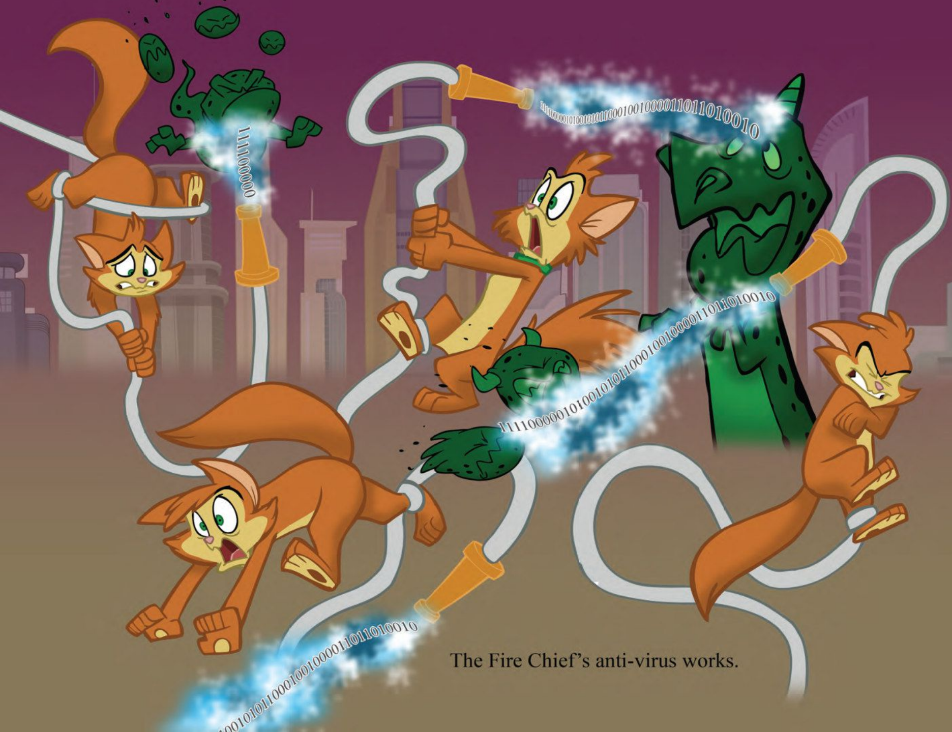
The Fire Chief's anti-virus works.