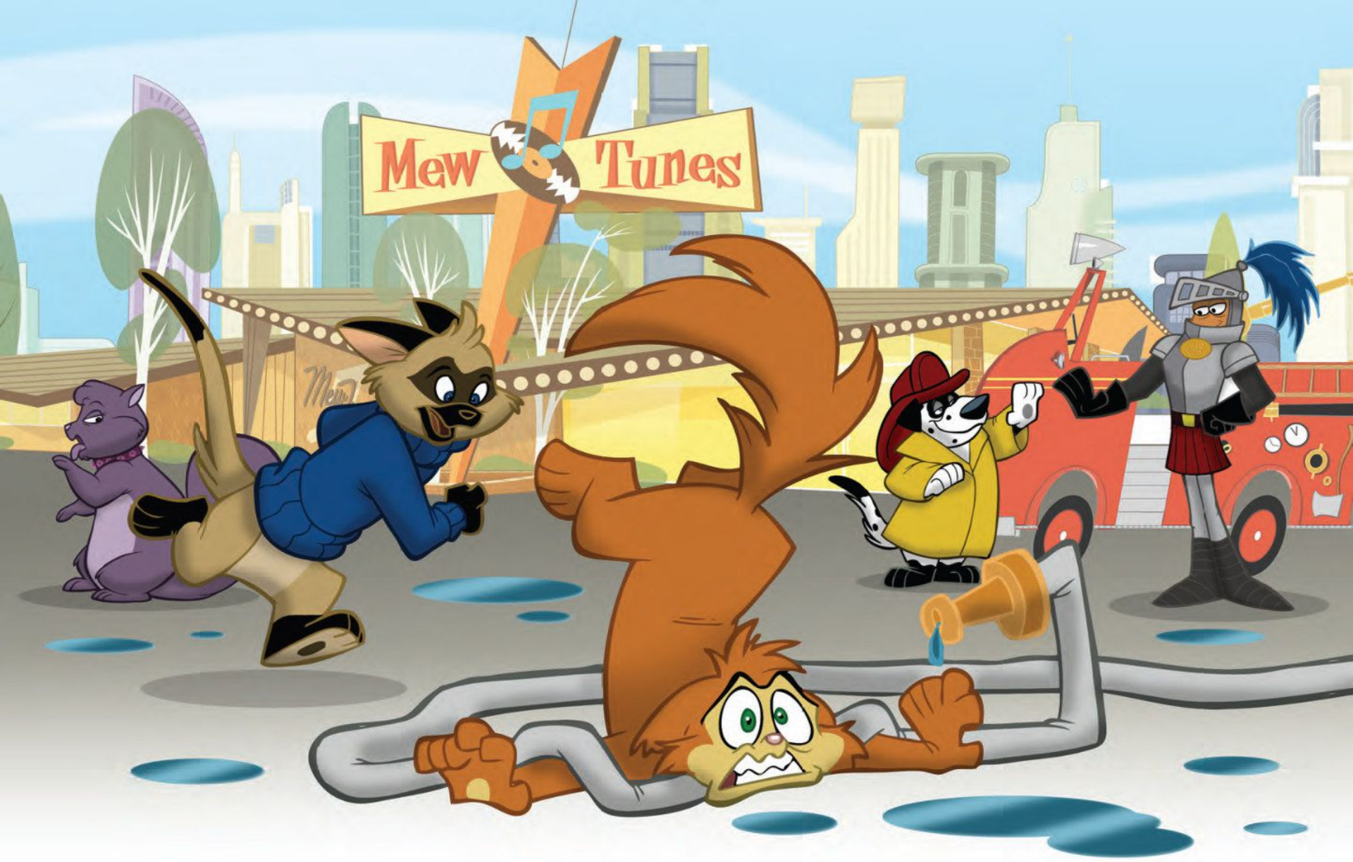
Whew! That was a close one!