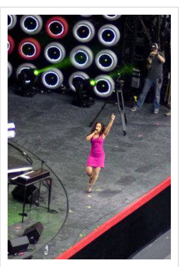
Keys performing at the Live Earth concert

Keys has also donated to Frum tha Ground Up, a non-profit organization that aids children and teenagers with scholarships. She performed in Philadelphia, Pennsylvania, as part of the worldwide Live 8 concerts to raise awareness of the poverty in Africa and to pressure the G8 leaders to take action. In 2005, Keys performed on ReAct Now: Music & Relief and Shelter from the Storm: A Concert for the Gulf Coast, two benefit programs that raised money for those affected by