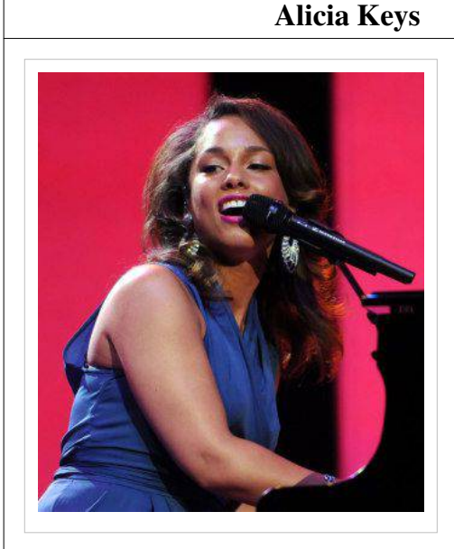
Keys performing in 2011.