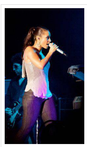
Keys performing at the 2008 Summer Sonic Festival in Tokyo, Japan

"No One" earned Keys the awards for Best Female R&B Vocal Performance and Best R&B Song at the 2008 Grammy Awards. Keys opened the ceremony singing Frank Sinatra's 1950s song "Learnin' the Blues" as a "duet" with archival footage of Sinatra in video and "No One" with John Mayer later in the show. Keys also won Best Female R&B Artist during the show. She starred in "Fresh Takes", a commercial micro-series created by Dove Go Fresh, which premiered during The Hills on MTV from March to April 2008. The premiere celebrated the launch of new Dove Go Fresh. She also signed a deal as spokesperson with Glacéau's VitaminWater to endorse the product, and was in an American Express commercial for the "Are you a Cardmember?" campaign. Keys, along with The White Stripes' guitarist and lead vocalist Jack White, recorded the theme song to Quantum of Solace, the first duet in Bond soundtrack history. In 2008, Keys was ranked in at number 80 the Billboard Hot 100 All-Time Top Artists. She also starred in The Secret Life of Bees, a film adaptation of Sue Monk Kidd's acclaimed 2003 bestseller novel of the same name alongside Jennifer Hudson, Dakota Fanning, Paul Bettany and Queen Latifah, released in October 2008 via Fox Searchlight. The Secret Life of Bees had a hit moderate performance at the box office, earning only $39,947,322 worldwide during its theatrical run. Her