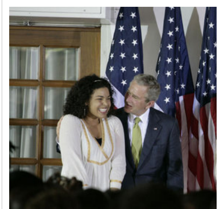
US President George W. Bush congratulates Sparks after she sang the U.S. National Anthem during the welcome for President Bush and Mrs. Laura Bush to the U.S. Ambassador's Residence in Ghana.

On July 28, 2011, Sparks performed a live surprise concert in Times Square. Sparks was named the "VH1 Save The Music Foundation Ambassador" in 2011. It was announced on November 9, 2011, that Sparks would be titled as a