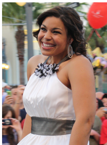
Sparks in the American Idol Experience motorcade at Walt Disney World in 2009.