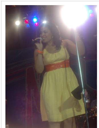
Sparks during a concert in Kansas City

After winning American Idol , Sparks signed to 19 Recordings/Jive Records, becoming the first Idol winner to join the label. On August 27, 2007, she released her debut single, "Tattoo", which peaked at number eight on the Billboard Hot 100, becoming Sparks' first top ten hit on the chart. The song certified platinum in the United States and Australia. To date, "Tattoo" has sold over two million copies in the U.S.