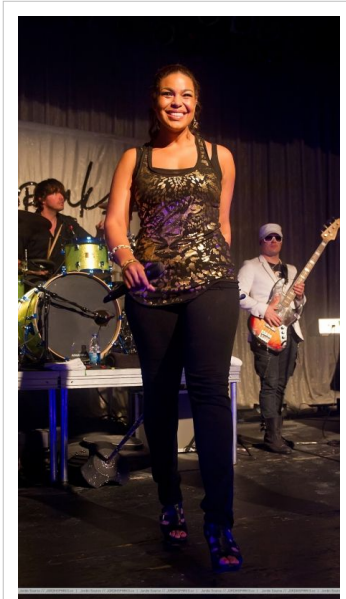
Sparks during Battlefield Tour

In May 2010, Sparks embarked on her first headlining tour in the United States, the Battlefield Tour . It began on May 1, 2010, and ended on July 18, 2010, stopping in over 35 major cities in the United States. In support of the DVD/Blu-ray re-release of the Disney animated film, Beauty and the Beast , Sparks recorded a cover of the film's title track for the soundtrack. A music video for the song was released on October 18, 2010.