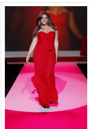
Sparks in Badgley Mischka

In support of the album, Sparks opened for Alicia Keys on the North America leg of her As I Am Tour, starting on April 19, 2008. Before the tour, a career-threatening throat injury forced Sparks to cancel a few weeks of the shows. Officials revealed she was suffering an acute vocal cord hemorrhage and was ordered strict vocal rest until the condition improved. Sparks was back on the road by April 30, 2008 and remained on the tour until June 18, 2008. Sparks later joined Keys for the tour leg in Australia and New Zealand in December