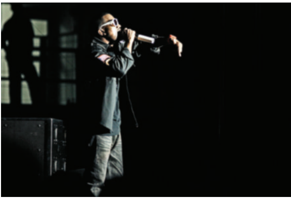
West performing in Kuala Lumpur, Malaysia, April 2007.

Fresh off spending the previous year touring the world with U2 on their Vertigo Tour, West felt inspired to compose anthemic rap songs that could operate more efficiently in large arenas. To this end, West incorporated the synthesizer into his hip-hop production, utilized slower tempos, and experimented with electronic music and influenced by music of the 1980s. In addition to U2, West drew musical inspiration from arena rock bands such as The Rolling Stones and Led Zeppelin in terms of melody and chord progression. To make his next effort, the third in a planned tetralogy of education-themed studio albums, more introspective and personal in lyricism,