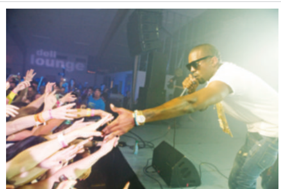
West performing in Austin, Texas, March 2009