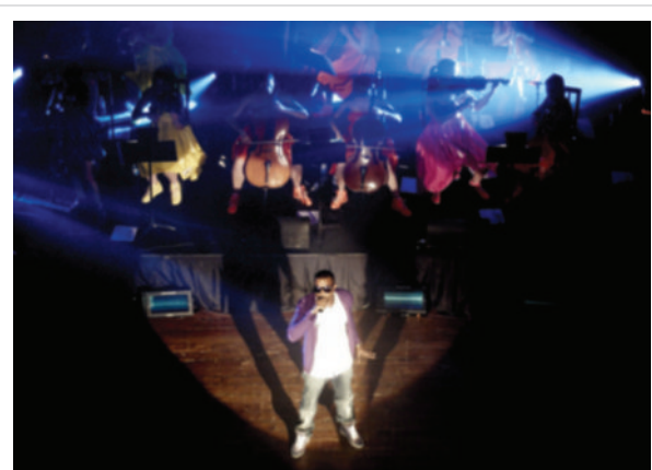
West accompanied by an 11-piece chamber orchestra.