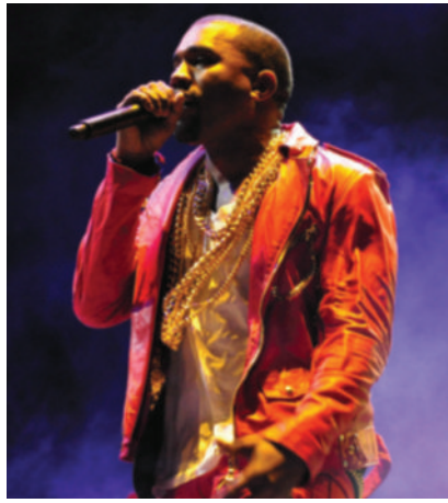
West performing at Lollapalooza in 2011