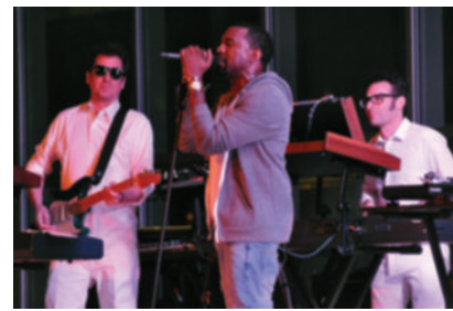
West performing at The Museum of Modern Art's annual Party, May 2011

West has additionally appeared and participated in many fundraisers, benefit concerts, and has done community work for Hurricane Katrina relief, the Kanye West Foundation, the Millions More Movement, 100 Black Men of America, a Live Earth concert benefit, World Water Day rally and march, Nike runs, and a MTV special helping young Iraq War veterans who struggle through debt and PTSD a second chance after returning home.