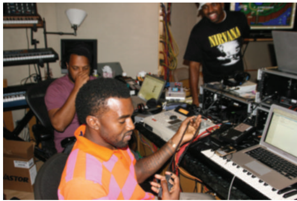
West working in the studio with his mentor No ID (left)

At the start of his career, West often used pitched-up vocal samples, usually from soul songs, in his production, along with his own drums and instruments. His first major release featuring his trademark vocal sampling style was "This Can't Be Life", a track from Jay-Z's The Dynasty: Roc La Familia . West said he sped up the drum beat of Dr. Dre's "Xxplosive" to use as a replacement for his drums on "This Can't Be Life".