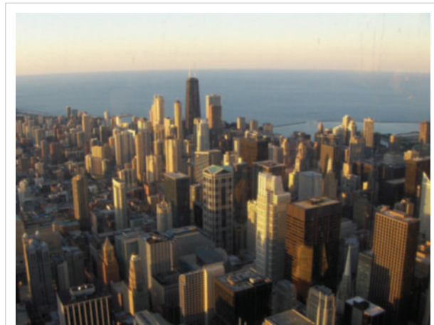
West moved to Chicago, Illinois at age three and became involved in its hip hop scene as a teen.