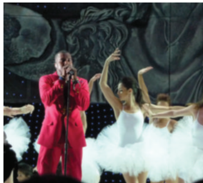
West at Coachella on April 17, 2011

time, West initiated the free music program G.O.O.D. Fridays through his website, offering a free download of previously unreleased songs each Friday of the week, a portion of which were included on the album. Dark Fantasy went on to go platinum in the United States, but its omission as a contender for Album of the Year at the 54th Grammy Awards was viewed as a "snub" by several media outlets.