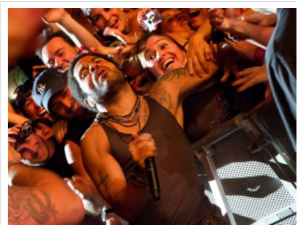
Kravitz and some fans during Rock in Rio Madrid 2012.

In 1985, Kravitz's parents divorced, which had a profound impact on him. His relationship with his father became extremely strained. Kravitz focused on his music to help him get through this period. That year, Kravitz met actress Lisa Bonet backstage at a New Edition concert. Bonet worked on The Cosby Show , the number one rated show on television. They were close friends for two years before falling in love. Like Kravitz, Bonet is half African American and half Russian Jewish. Kravitz moved back to New York City where The Cosby Show was produced in 1987, moving in with then girlfriend Bonet. Kravitz and Bonet eloped to be married on November 16, 1987, her 20th birthday, in a Las Vegas ceremony. Kravitz, still known as Romeo Blue at the time, suddenly found himself in the headlines of tabloid newspapers. They had a daughter, Zoë Isabella Kravitz, born on December 1, 1988. [13] Kravitz and Bonet divorced in 1993. [citation needed] In 2001, he began dating model Adriana Lima. In 2002, the couple was engaged, but less than a year later, the engagement was called off.