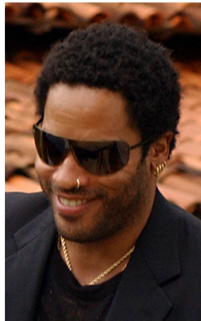
Kravitz in Brasilia, Brazil on March 19, 2005

Kravitz released his sixth album Lenny in October 2001. The album was recorded in Miami. Kravitz wrote the song "Bank Robber Man" after the Miami Police Department detained and cuffed him while walking to the gym with his trainer because police stated that he matched the description of a bank robber. Kravitz did not have any identification with him at the time and the police on the scene did not believe that he was indeed Lenny Kravitz. The bank teller who was robbed was then brought to the scene and said Kravitz was not the bank robber. Miami Police later sent officers to Kravitz's home to apologize for the detention. When asked if he thought the incident was a case of racial profiling, Kravitz said he wasn't sure although some of the lyrics in the song suggest otherwise. The first single from the album, "Dig In", went to number 1 in Argentina and the top 10 in Italy and Portugal. The video for "Dig In" was originally supposed to be shot at the top of the Empire State Building on September 12, 2001 but the terrorist attacks on the World Trade Center on September 11, 2001 caused the location to be moved. The video was later shot off the coast Miami. He won his fourth Grammy in 2002. "Stillness of Heart", "Believe in Me", and "If I Could Fall In Love" were subsequent singles from the album.