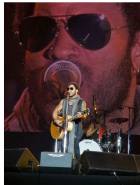
Kravitz performing in Madrid on June 30, 2012.

During the Italian leg of his 53 date Let Love Rule (20)09 European tour, Kravitz had been instructed to cancel some shows due to a bad bout of bronchitis. Under strict orders from his doctor, the singer was told to rest so that he could make a quick recovery and return to the stage for the rest of his tour. Shows scheduled for Rome on June 5 and Brescia on June 6 were postponed to late July.