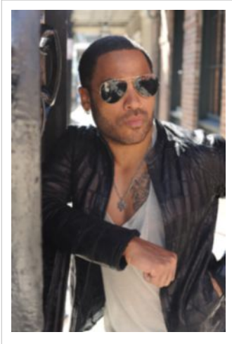
Kravitz in January 2011