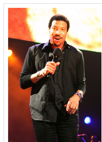
Richie performing in March 2011

Richie's 1982 self-titled debut contained three hit singles: the U.S. #1 song "Truly", which launched his career as one of the most successful balladeers of the 1980s, and the top five hits "You Are" and "My Love". The album hit #3 on the music charts and sold over 4 million copies. His 1983 follow-up album, Can't Slow Down , sold over twice as many copies and won two Grammy Awards, including Album of the Year, propelling him into the first rank of international superstars. The album contained the #1 hit "All Night Long" a Caribbean-flavored dance number that was promoted by a colorful music video produced by former Monkee Michael Nesmith. In 1984, Richie performed "All Night Long" at the closing ceremony of the XXIII Olympic Games in Los Angeles.