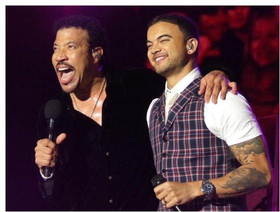
Richie and Guy Sebastian performing "All Night Long" during Richie's 2011 Australian and New Zealand tour.

Richie returned to Australia in 2011 where he and guest artist Guy Sebastian toured the country and New Zealand with concert dates throughout March and April. [3][4] Richie and Guy Sebastian have recorded Richie's 1983 #1 single "All Night Long" together, to raise money for Australian floods and New Zealand earthquake relief. Richie handpicked Sebastian to support him in Australia and the pair will perform the song together at each concert. [5][6]