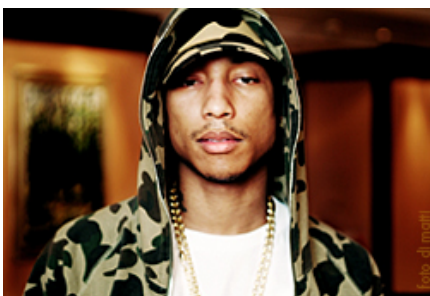
Pharrell Williams in Berlin, March 2005

At this point The Neptunes were gaining a wide fanbase and audience. In 2001, The Neptunes produced Britney Spears' single, "I'm a Slave 4 U" gaining their first worldwide number one. [4] The same year, N.E.R.D, consisting of Williams, Hugo and Haley, released their first album, In Search of... , in Europe, where the first Kelis album was better received. The album sounded very much like their previous production work; the group decided that they should make their work as N.E.R.D sound different, and re-recorded the album with the rock band Spymob. Williams and Hugo met rap duo Clipse in Virginia Beach in 1993, where they were signed to Arista Records through