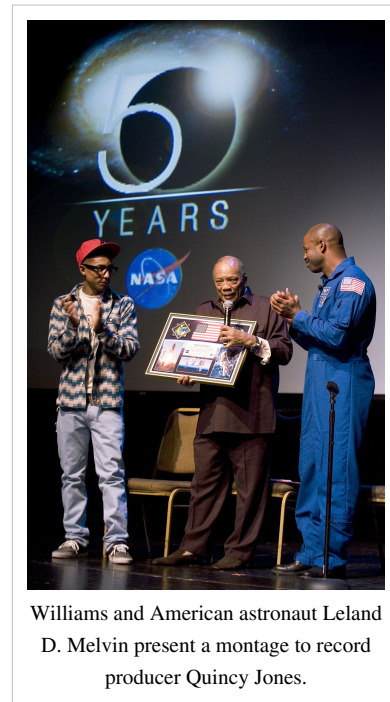
Williams and American astronaut Leland D. Melvin present a montage to record producer Quincy Jones.

Williams continued working with a variety of artists, including Shakira on the songs 'Did It Again', 'Why Wait', 'Good Stuff' and 'Long Time' for her sixth studio album, She Wolf . In September 2009, Williams was credited as a co-writer and producer of the song "Fresh Out the Oven" for Jennifer Lopez. It was released as a buzz single from Lopez's seventh studio album Love? The following month, Williams made a guest appearance on French indie/electronic rapper Uffie's first album, which arrived in early 2010. [6] In late 2009, Williams worked with the