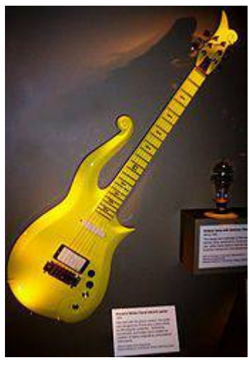
Prince's Yellow Cloud Guitar at the Smithsonian Institution Building

After two failed attempts in 1990 and 1991,<sup>[96]</sup> Warner Bros. released a greatest hits compilation with the three-disc The Hits/The B-Sides in 1993. The first two discs were also sold separately as The Hits 1 and The Hits 2 . The collection features the majority of Prince's hit singles (with the exception of "Batdance" and other songs that appeared on the Batman soundtrack), and several previously hard-to-find recordings, including B-sides spanning the majority of Prince's career, as well as some previously unreleased tracks such as the Revolution-recorded"Power Fantastic" and a live recording of "Nothing Compares 2 U" with Rosie Gaines. Two new songs, "Pink Cashmere" and "Peach", were chosen as promotional singles to accompany the compilation album.