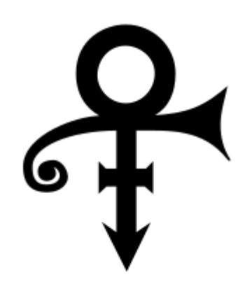
The unpronounceable symbol (later dubbed "Love Symbol #2")

In 1993, in rebellion against Warner Bros., which refused to release Prince's enormous backlog of music at a steady pace, Prince officially adopted the aforementioned "Love Symbol" as his stage name. In order to use the symbol in print media, Warner Bros. had to organize a mass mailing of Itopy disks with a custom font. At this time, Prince was alternatively referred to as "The Artist Formerly Known as Prince" or simply "The Artist Itol.