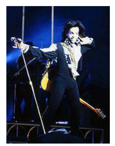
Prince performing during his Nude Tour in 1990

Prince again took his post-Revolution backing band (minus the Bodyguards) on a three leg, 84-show <u>Lovesexy World Tour</u>; although the shows were well-received by huge crowds, they failed to make a net profit due to the expensive sets and profit. [82]