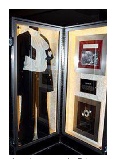
A costume worn by Prince and associated memorabilia, displayed at a Hard Rock Cafe in Australia

As a performer, he was known for his flamboyant style and showmanship.<sup>[241]</sup> He came to be regarded as a <u>sex symbol</u> for his <u>androgynous</u>, amorphous sexuality,<sup>[245]</sup> play with signifiers of <u>gender</u>,<sup>[246][247]</sup> and defiance of <u>racial stereotypes</u>.<sup>[248]</sup> His "audacious, idiosyncratic" fashion sense made use of "ubiquitous purple, alluring makeup and frilled garments."<sup>[240]</sup> His