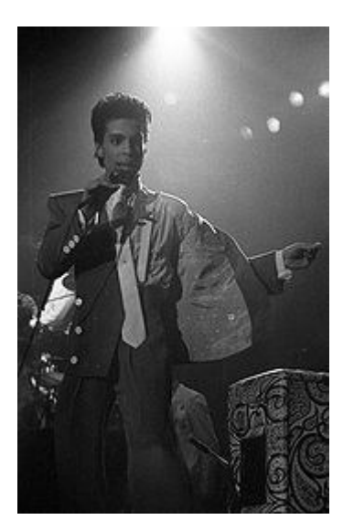
Prince performing in Brussels during the Hit N Run Tour in 1986

In late 1984, pop artist Andy Warhol created the painting, Orange Prince (1984) . Vanity Fair reproduced Warhol's portrait to accompany an article Purple Fame in the November 1984 edition, and claimed that the silkscreen image with its pop colors captured the recording artist "at the height of his powers". The 1984 Vanity Fair article was one of the first global media pieces written as a critical appreciation of the musician, which coincided with the start of the 98-date urple Rain Tour. [58]