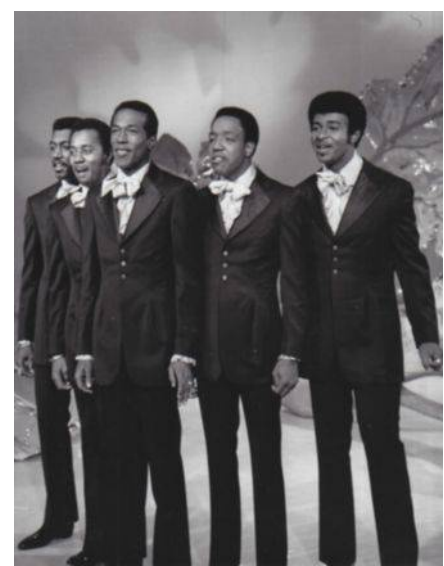
The Temptations perform on The Ed Sullivan Show in September 1969. Left to right: Otis Williams, Melvin Franklin, Eddie Kendricks, Paul Williams, and Dennis Edwards.

The blending of the Motown sound and psychedelic rock sound resulted in a new subgenre of music called "psychedelic soul", also evident in the work of Diana Ross and the Supremes ("Reflections", "Love Child"), Marvin Gaye's version of "I Heard It Through the Grapevine", and the music of The 5th Dimension, The Undisputed Truth, and The Friends of Distinction. More Temptations psychedelic soul singles would follow in 1969 and 1970, among them "Runaway Child, Running Wild" (a number-one R&B hit), "I Can't Get Next to You" (a number-one pop hit), "Psychedelic Shack", and "Ball of Confusion (That's What the World Is Today)", but the formula began to wear thin when "Ungena Za Ulimwengu (Unite the World)", only went to #33 Pop in the fall of 1970. The group's other important albums from this period included Puzzle People (1969) and Psychedelic Shack (1970). Psychedelic Shack includes the original version of "War", later made famous by Edwin Starr.