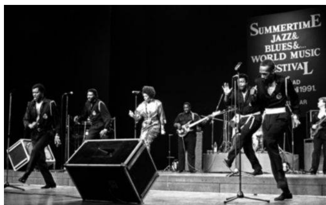
Eddie Kendrick (right front) and Dennis Edwards (right back) perform with their spin-off "Temptations" act in July 1991 at the Summertime Jazz, Blues & World Music Festival in Belgrade, Yugoslavia (now Serbia).