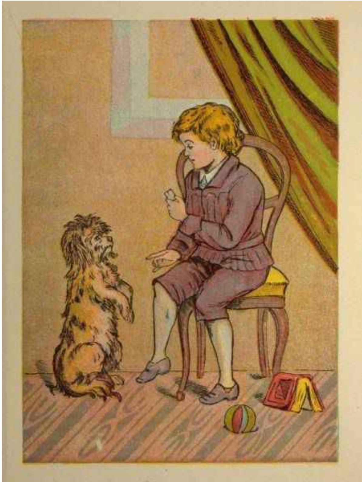
THE LITTLE MARINERS