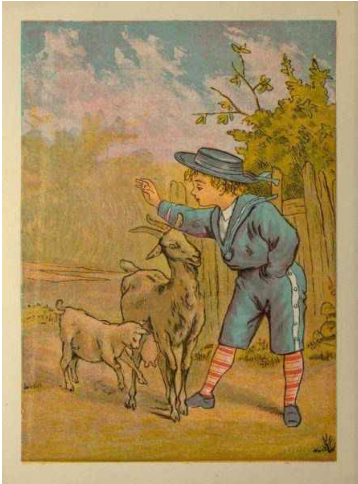
THE DOG OF THE REGIMENT