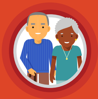
Adults aged 65 and older