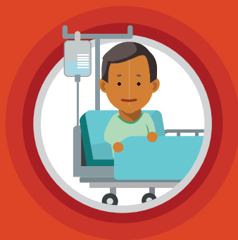
People with weakened immune systems