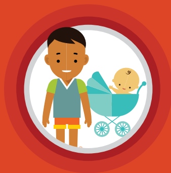
Children younger than 5 years