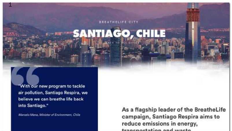
City page on BreatheLife website (Santiago, Chile)