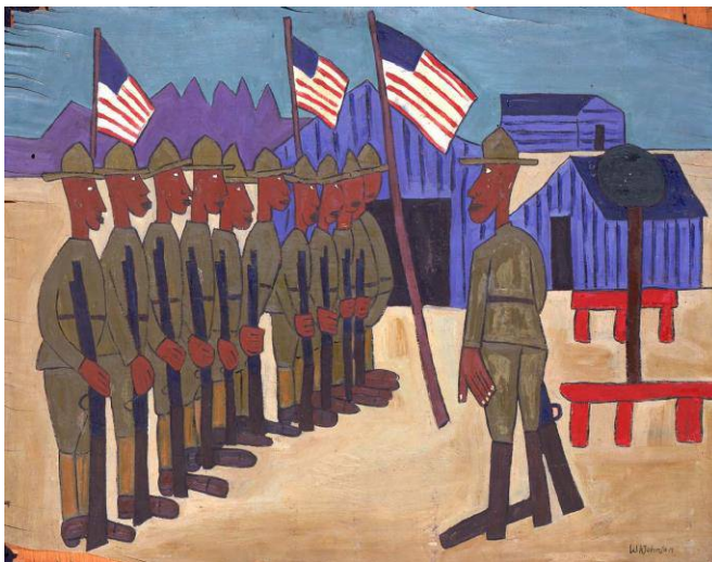
Soldiers Training , ca. 1942, William H. Johnson, oil on plywood, Smithsonian American Art Museum

While the fight for African American civil rights has been traditionally linked to the 1960s, the discriminatory experiences faced by black soldiers during World War II are often viewed by historians as the civil rights precursor to the 1960s movement. During the war America's dedication to its democratic ideals was tested, specifically in its treatment of its black soldiers. The hypocrisy of waging a war on fascism abroad, yet failing to provide equal rights back home was not lost. The onset of the war brought into sharp contrast the rights of white and black American citizens. Although free, African Americans had yet to achieve full equality. The discriminatory practices in the military regarding black involvement made this distinction abundantly clear. There were only four U.S. Army units under which African Americans could serve. Prior to 1940, thirty thousand blacks had tried to enlist in the Army, but were turned away. In the U.S. Navy, blacks were restricted to roles as messmen. They were excluded entirely from the Air Corps and the Marines. This level of inequality gave rise to black organizations and leaders who challenged the status quo, demanding greater involvement in the U.S. military and an end to the military's segregated racial practices.