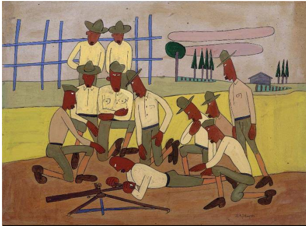
Lessons in a Soldier's Life , ca. 1942, William H. Johnson, tempera on paper, Smithsonian American Art Museum

war, yet others could not ignore the hypocrisy of the situation with which they were faced. America had joined a war that opposed fascism and discrimination abroad, yet subjected a segment of its citizens to discriminatory practices and segregation. The irony of this was not lost, especially among young African Americans. Many wondered why they ought to serve. George Schuyler, a noted columnist for the popular black newspaper, the Pittsburgh Courier , argued, “Why should Negroes fight for democracy abroad when they are refused democracy in every American