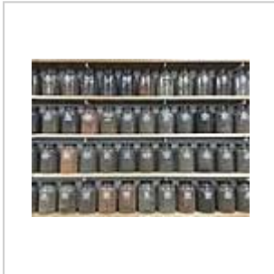
A collection of soil from lynching sites across the United States on display at the museum