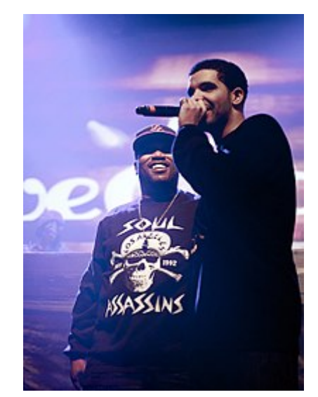
Drake performing alongside Bun B in 2011.

"<u>Headlines</u>" was released on August 9 as the lead single for Take Care . It was met with positive critical and commercial response, reaching number thirteen on the Hot 100, as well as becoming his tenth single to reach the summit of the Billboard <u>Hot Rap Songs</u>, making Drake the artist with the most number-one singles on the chart, with 12.<sup>[94]</sup> It was eventually certified Platinum in both the United States and Canada.<sup>[95]</sup> The music