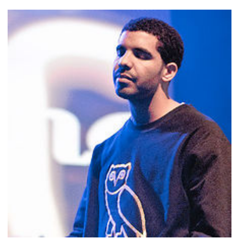
Drake during a performance in Toronto in 2011

Prior to the album's release, Drake planned to record a collaborative album with Lil Wayne; however, it was ultimately scrapped due to the success of Watch the Throne .<sup>[100][101][102]</sup> He also began collaborations with <u>Rick Ross</u> for a mixtape titled Y.O.L.O. , but the duo decided against the project in favor of increased concern for their respective studio albums.<sup>[103][104]</sup>