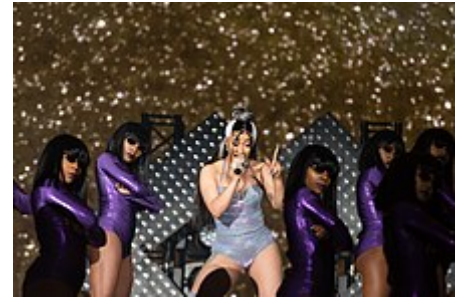
Cardi B performing in July 2019

and the third most nominations in a year ever (behind Drake and The Chainsmokers, who both had 22 in a year). [126] She ended up winning six awards, including for Top Hot 100 Song , bringing her career total wins to seven—the most of any female rapper in history. [127] An article by Omaha World-Herald called her "the biggest rapper in the world." [128]