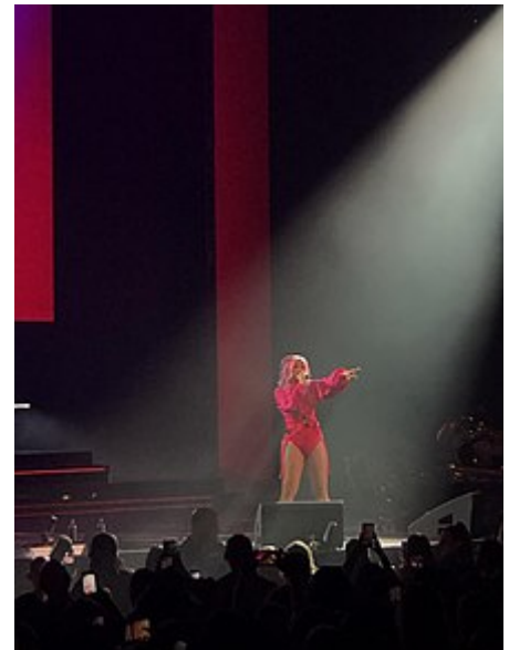
Cardi B at Pinnacle Bank Arena in 2019