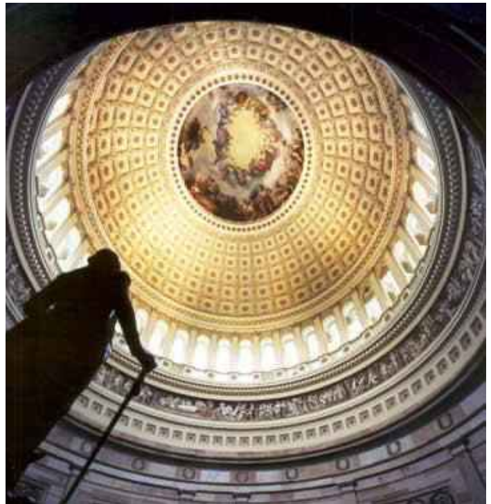
The Rotunda of the U.S. Capitol.

Congress is divided into two parts—the Senate and the House of Representatives. Because it has two “chambers,” the U.S. Congress is known as a “bicameral” legislature. The system of checks and balances works in Congress. Specific powers are assigned to each of these chambers. For example, only the Senate has the power to reject a treaty signed by the president or a person the president chooses to serve on the Supreme Court. Only the House of Representatives has the power to introduce a bill that requires Americans to pay taxes.