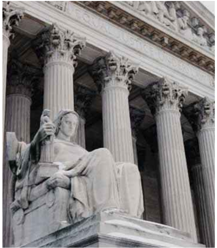
The Contemplation of Justice statue outside the U.S. Supreme Court building in Washington, D.C.

The judicial branch is one of the three branches of government. The Constitution established the judicial