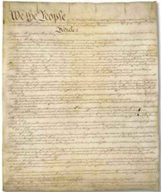
The Constitution of the United States.

The Constitution, written in 1787, created a new system of U.S. government—the same system we have today. James Madison was the main writer of the Constitution. He became the fourth president of the United States. The U.S. Constitution is short, but it defines the principles of government and the rights of citizens in the United States. The document has a preamble and seven articles. Since its adoption, the Constitution has been amended (changed) 27 times. Three-fourths of the states (9 of the original 13) were required to ratify (approve) the Constitution. Delaware was the first state to ratify the Constitution on December 7, 1787. In 1788, New Hampshire was the ninth state to ratify the Constitution. On March 4, 1789, the Constitution took effect and Congress met for the first time. George Washington was inaugurated as president the same year. By 1790, all 13 states had ratified the Constitution.