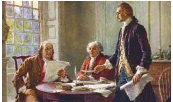
Benjamin Franklin, John Adams, and Thomas Jefferson in “Writing the Declaration of Independence, 1776,” by Jean Leon Gerome Ferris.

The Declaration of Independence lists three rights that the Founding Fathers considered to be natural and “unalienable.” They are the right to life, liberty, and the pursuit of happiness. These ideas about freedom and individual rights were the basis for declaring America’s independence. Thomas Jefferson and the other Founding Fathers believed that people are born with natural rights that no government can take away. Government exists to protect these rights. Because the people voluntarily give up power to a government, they can take that power back. The British government was not protecting the rights of the colonists, so the colonies took back their power and separated from Great Britain.