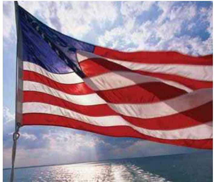
The American flag is an important symbol of the United States.

When the United States became an independent country, the Constitution gave Congress the power to establish a uniform rule of naturalization. Congress made rules about how immigrants could become citizens. Many of these requirements are still valid today, such as the requirements to live in the United States for a specific period of time, to be of good