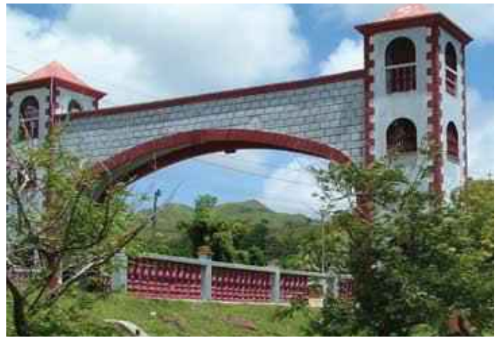
Old Spanish Bridge in Umatac, Guam.

The northern border of the United States stretches more than 5,000 miles from Maine in the East to Alaska in the West. There are 13 states on the border with Canada. The Treaty of Paris of 1783 established the official boundary between Canada and the United States after the Revolutionary War. Since that time, there have been land disputes, but they have been resolved through treaties. The International Boundary Commission, which is headed by two commissioners, one American and one Canadian, is responsible for maintaining the boundary.